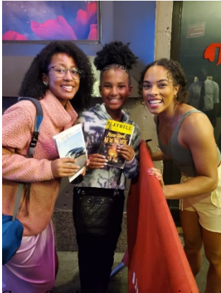
Camp Spotlight campers pictured with lead character Francine Evans from New York, New York !