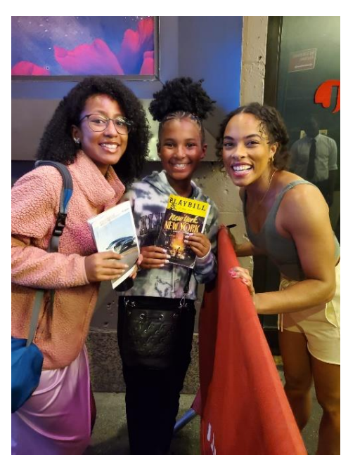
Camp Spotlight campers pictured with lead character Francine Evans from New York, New York!

Friday, July 12, 2024 - Sunday, July 14, 2024